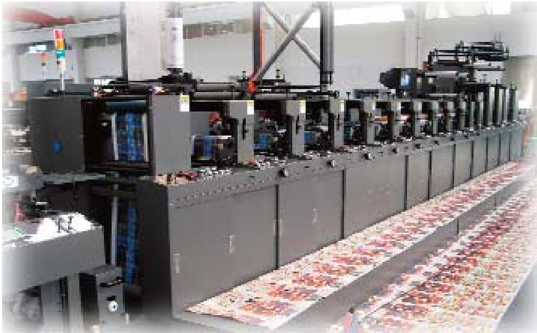
A nine colour xceed press under construction for installation in Australia.

MANUFACTURED EXCLUSIVELY FOR PRINT-PARTNERS